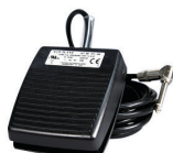
A803 Footswitch †